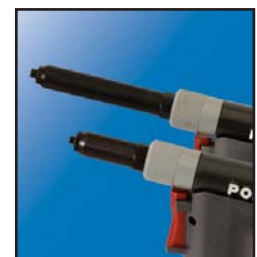
Extended Nose Housing Available

(*) Use FAN275-028 Jaw pusher set up; (**) Use DPN275-027 Jaw pusher set up.