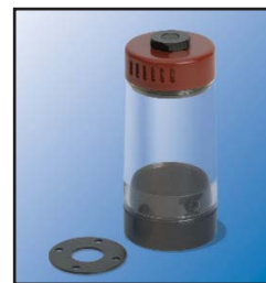
MCS Retrofit Kit