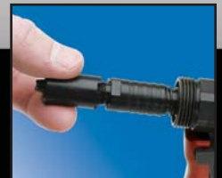
Quick Disconnect Jaw Guide Technology