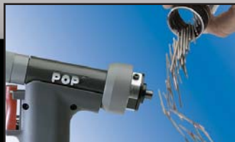
Quick Disconnect Mandrel Collector