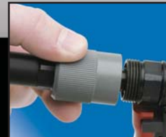
Quick Disconnect Nosehousing