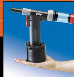
Lightweight and comfortable to operate