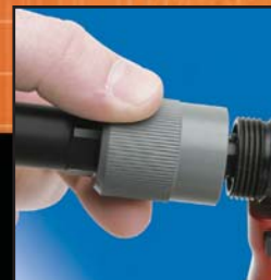
Quick disconnect Nosehousing