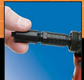
Quick disconnect Jaw Guide technology