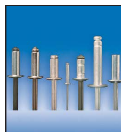
Insist on Genuine POP® Rivets