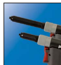
Extended nose housing

(*) Use FAN239-176 Jaw pusher set up; (†) Excludes MultiGrip; (‡) Set air pressure at 90 psi (6.2 bar).